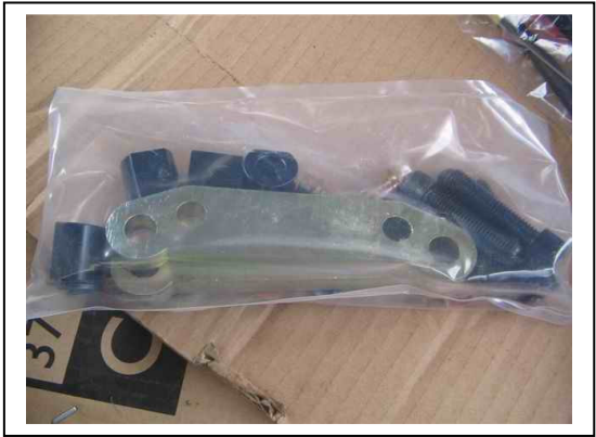
New Calliper Adaptor brackets