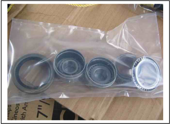
New bearings & seals. The seals supplied didn't fit the hubs supplied!