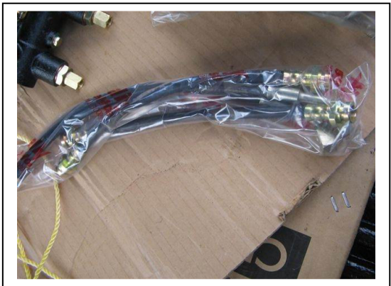
New hoses (to be replaced by stainless braided)