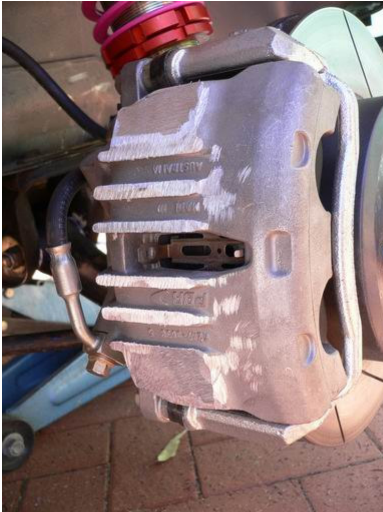
Rod rang Hopperstoppers who ok'd filing of the cooling fins after wheel spacers didn't help.