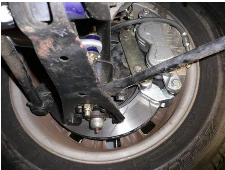
The calliper following grinding down, now allows the wheel to fit without scraping. Look how close it still is though. Time will tell whetherf it clears under all driving conditions