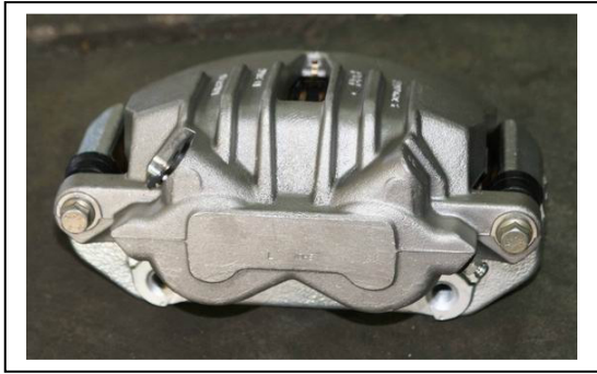
New Falcon AU XR8 callipers