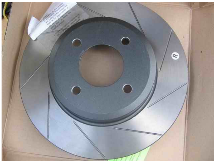
New 300mm Falcon AU XR8 rotor in Brake Kit

Job done, so my dream of adapting the GTR brakes didn't happen however if someone else wants to try, the info is all above.