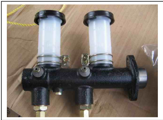
New 1 Inch Master Cylinder