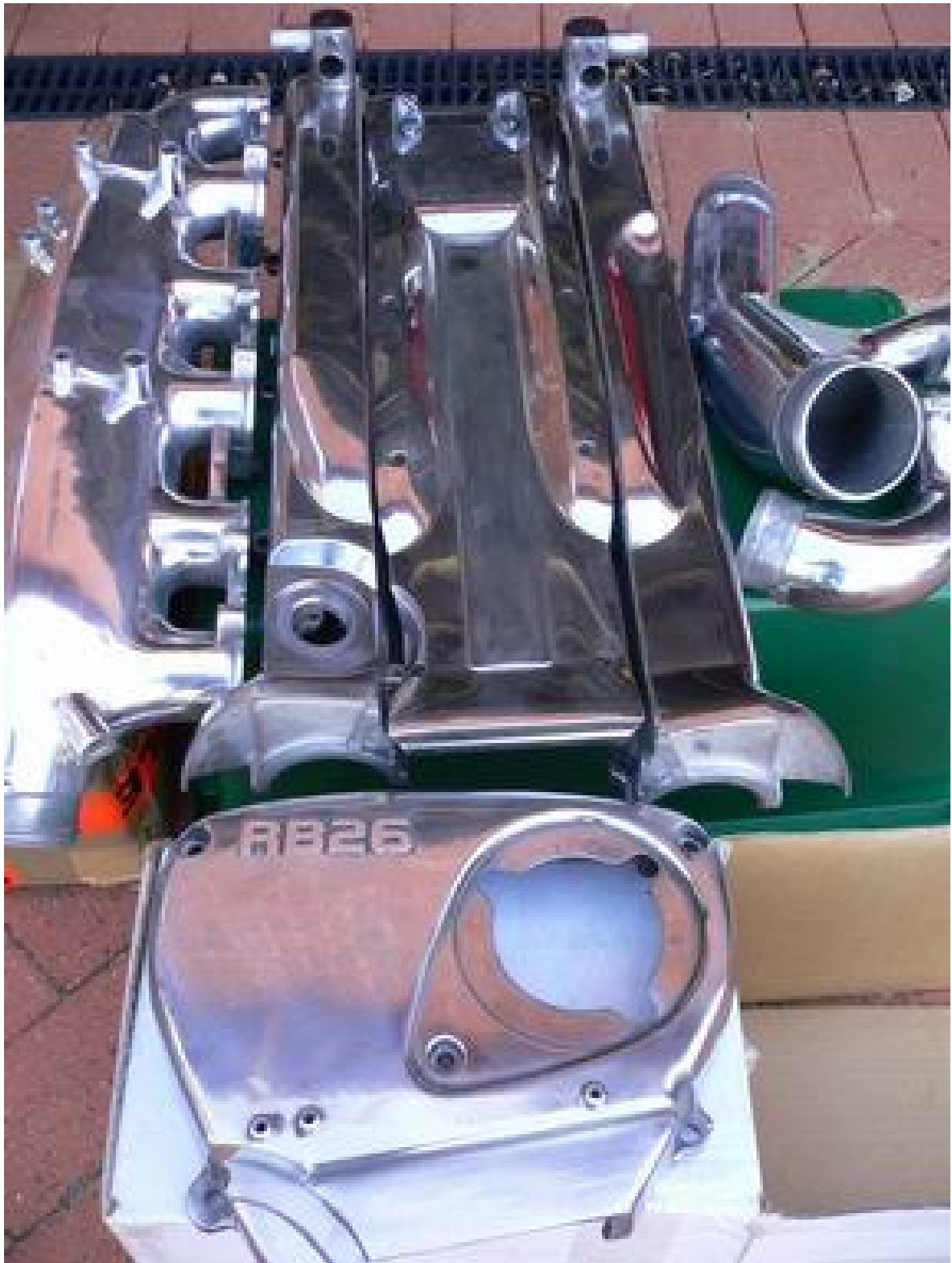
Cam covers, timing cover, plenums all stripped & polished A$500