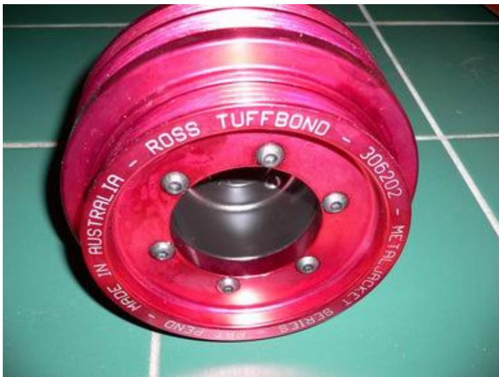
Tuffbond front pulley A$495