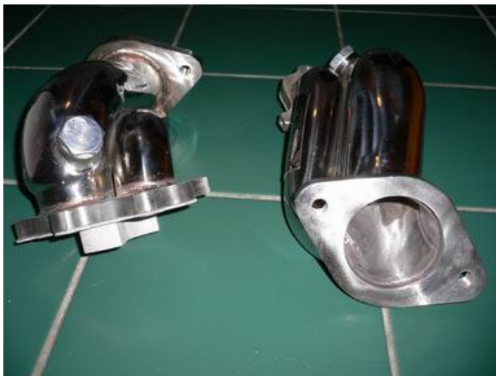
Stainless Dump pipes A$499