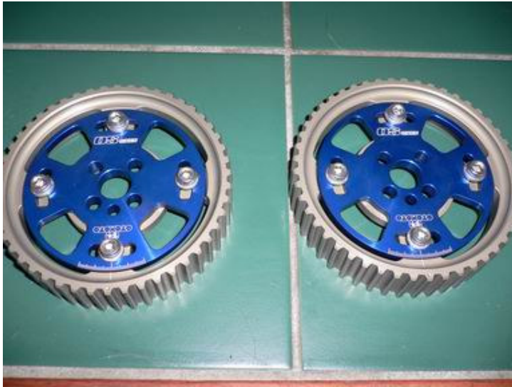
OS Giken Adjustable Cam gears A$399 pair