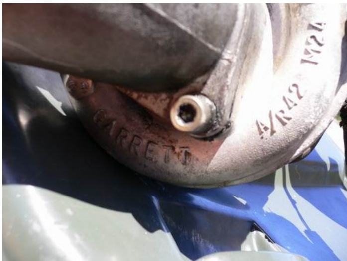
GTR Ceramic Turbo markings