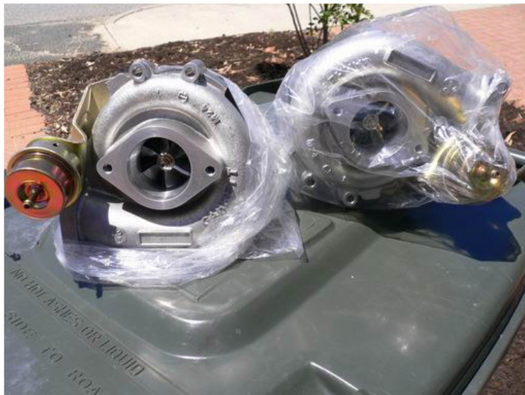
Ball Bearing Turbo 360HP Part No: Cost A$1250 each x 2

The next day I visited X Speed in Occonnor, to pick up my new Garrett Ball bearing Turbos. I was advised to get the 360HP version to avoid traction problems with the two wheel drive. The theory here was that a little bit of lag would assist with traction off the mark. These turbos are a direct replacement for the GTR turbos and so all lines and brackets bolt up. For anyone interested their code is . Cost was A$2500 for the pair.