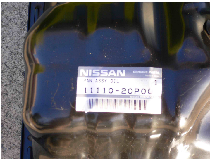
RB20 Sump A$340