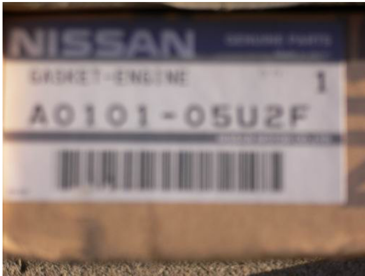
Engine Gasket Kit A$475