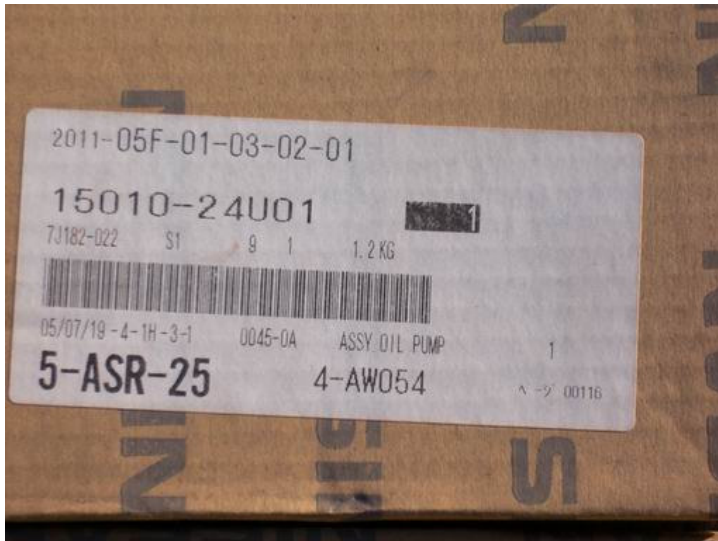
N1 Oil Pump A$525.00

The next day I visited X Speed in Occonnor, to pick up my new Garrett Ball bearing Turbos. I was advised to get the 360HP version to avoid traction problems with the two wheel drive. The theory here was that a little bit of lag would assist with traction off the mark. These turbos are a direct replacement for the GTR turbos and so all lines and brackets bolt up. For anyone interested their code is . Cost was A$2500 for the pair.