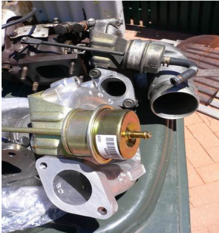
New Ball Bearing Turbo Vs GTR Ceramic Turbo