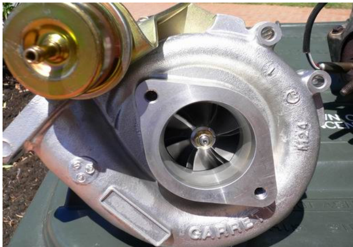
New Ball Bearing Turbo markings