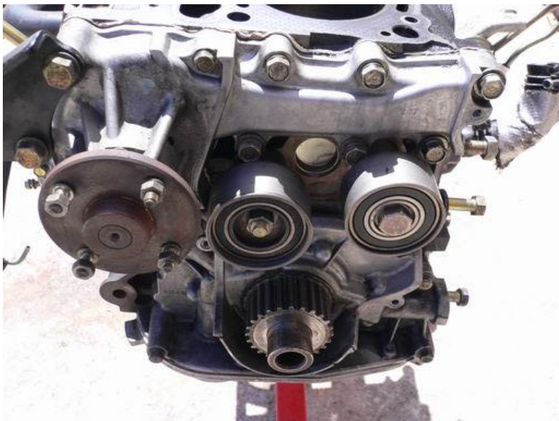
Timing belt removed, head removed, water pump still in place