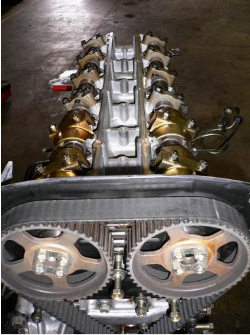
The cam covers & timing belt covers removed. Looks like a work of art! I like this photo