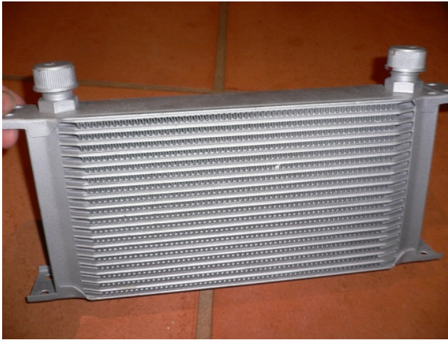
The 19 row cooler

The oil cooler purchased from Just Jap ($75) in NSW was fitted