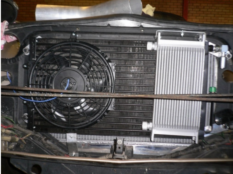
The cooler adjacent to the condenser

The hoses for the oil cooler will run across to the drivers side and back to the oil filter sandwich plate.