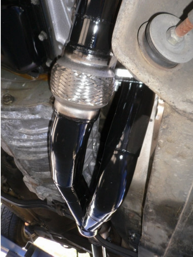
The Y pipe work hooking up to the two drop pipes.