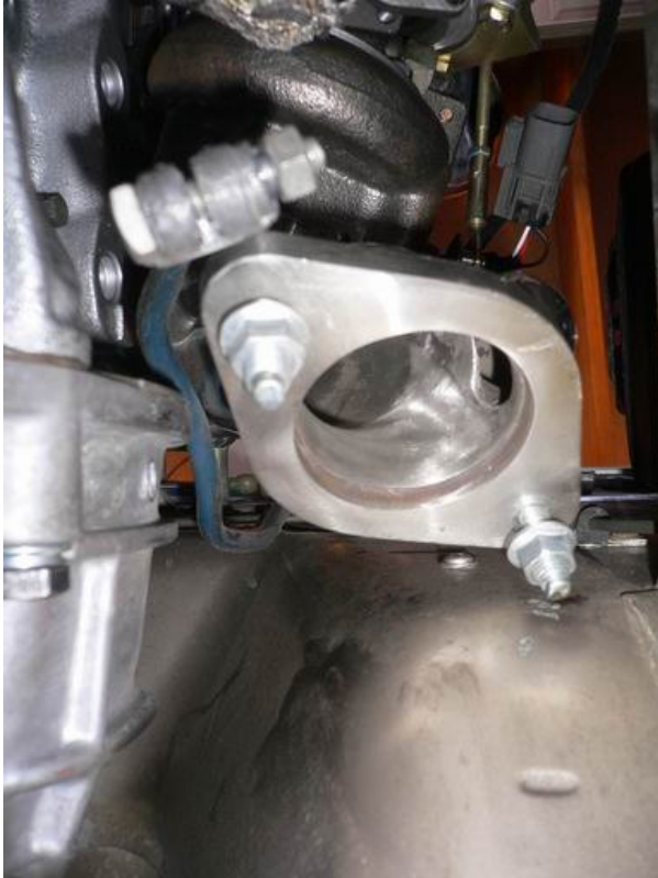
The rear turbo drop pipe from underneath.