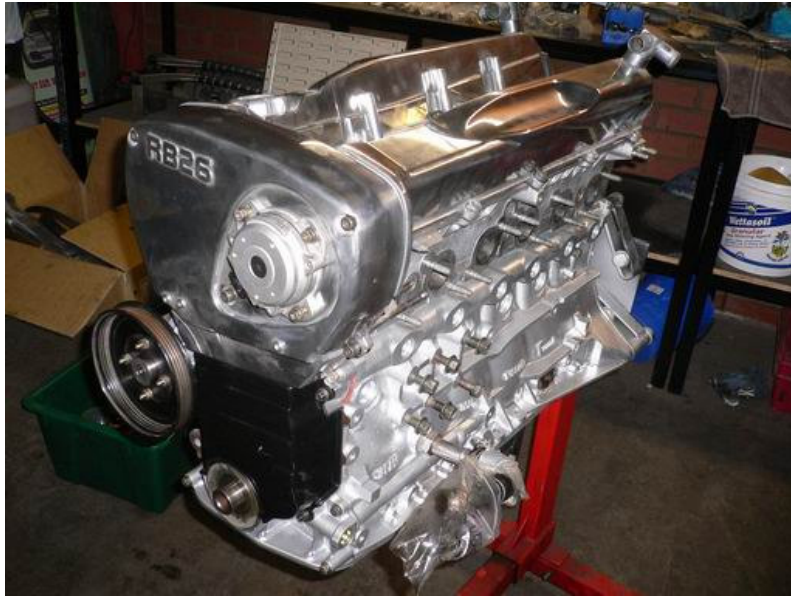
Progress at end of first day