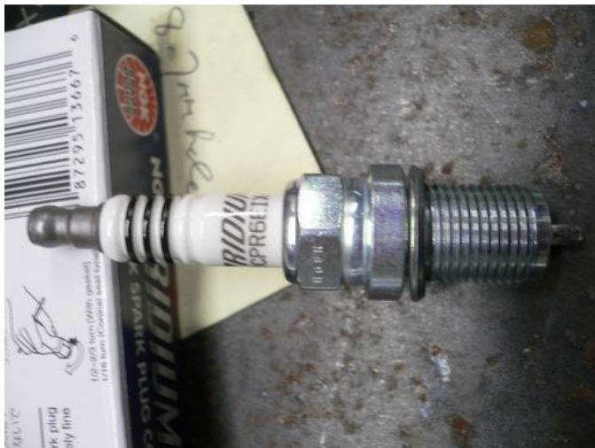
Iridium plugs fitted