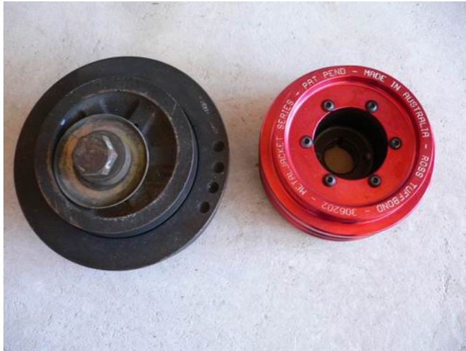
Original crank pulley vs Ross Tuffbond pulley