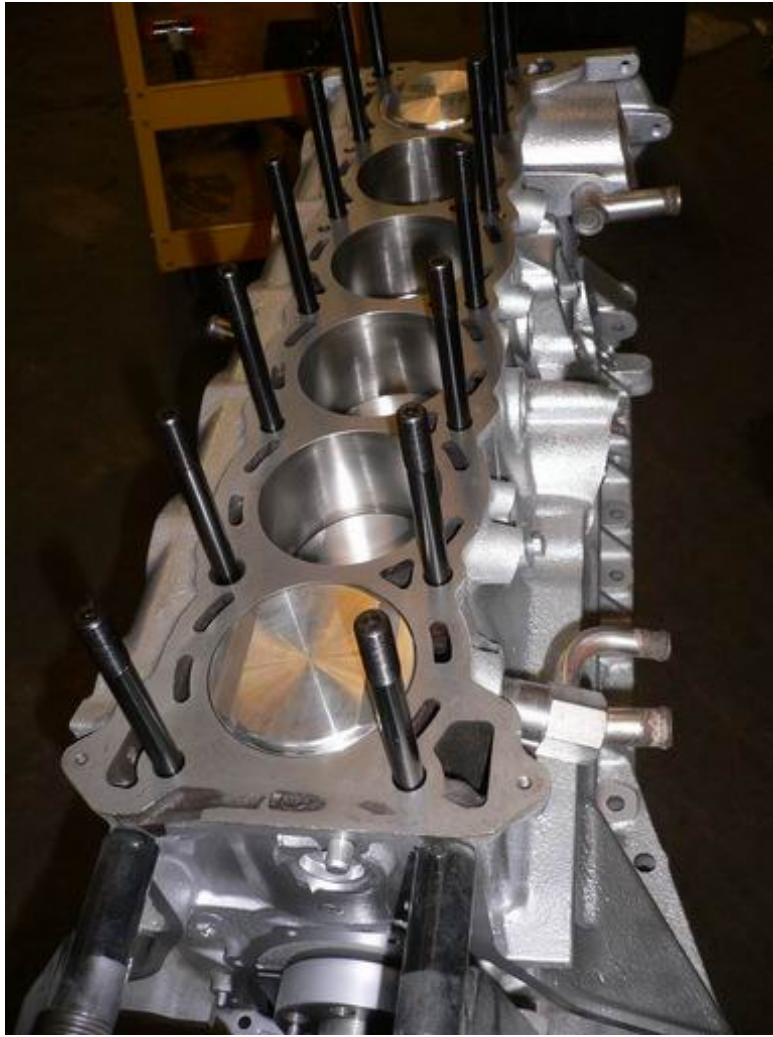
ARP head studs inserted