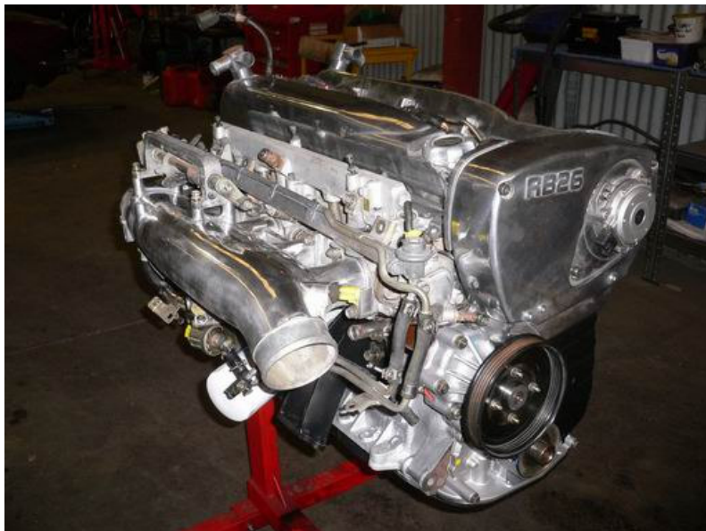
Progress next morning