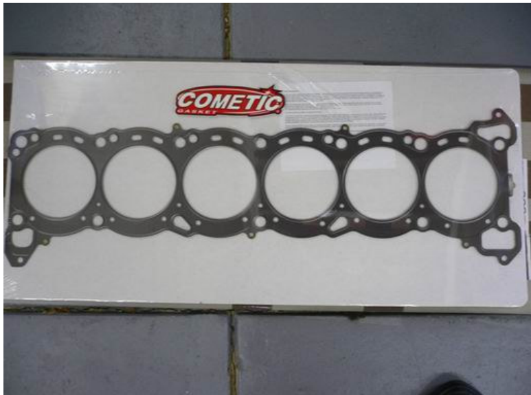
Cometic steel head gasket