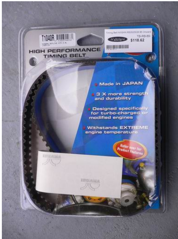
Gates heavy duty timing belt