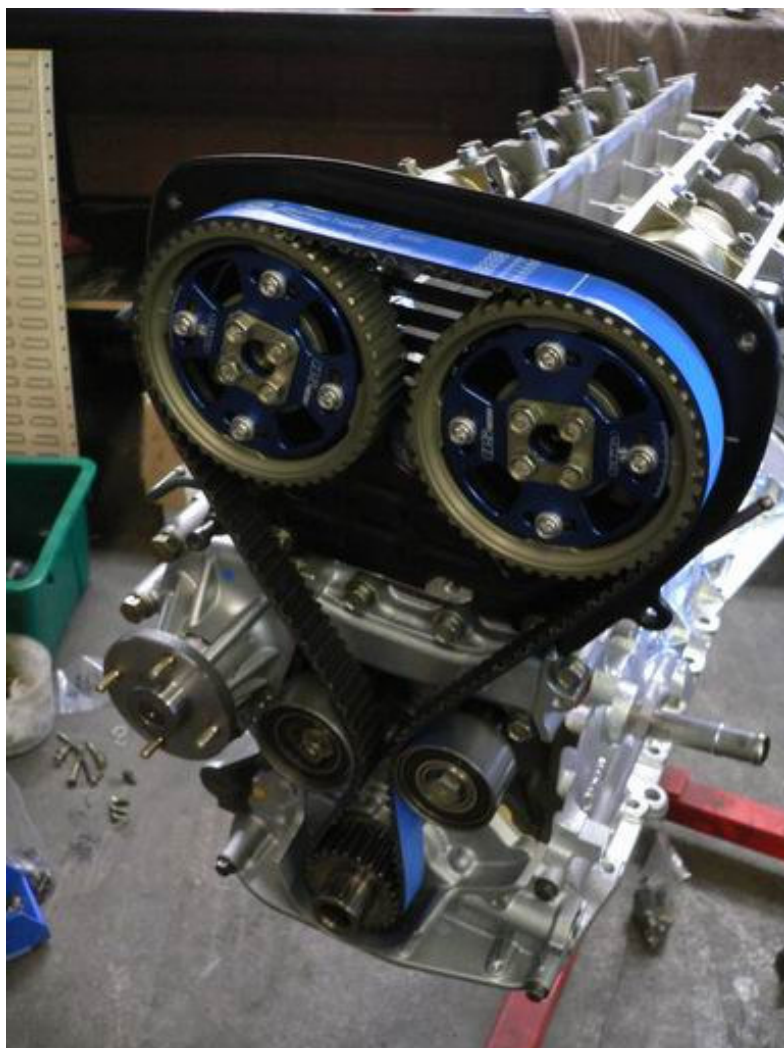
New Gates timing belt in place