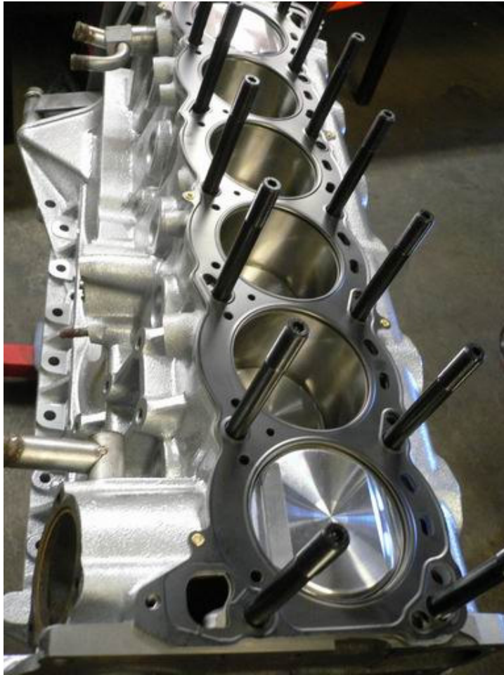
Cometic head gasket fitted