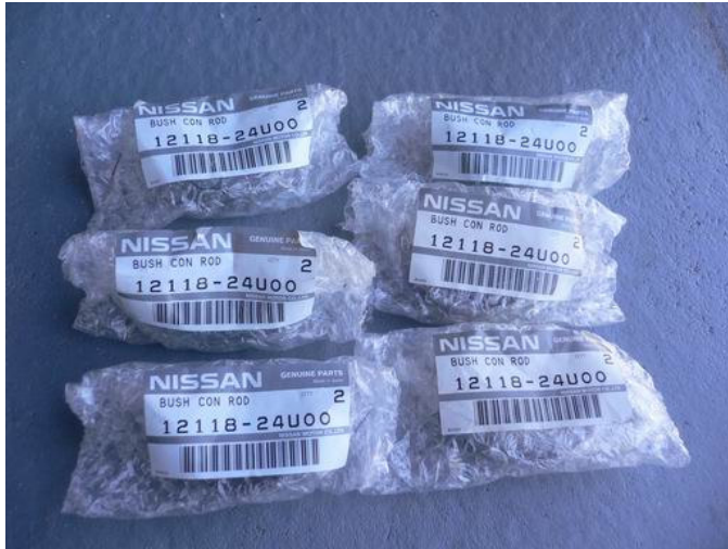
The N1 bearings