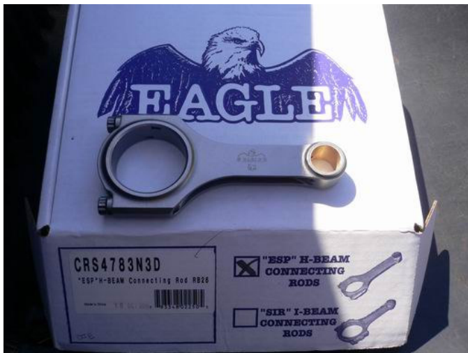
The forged rods