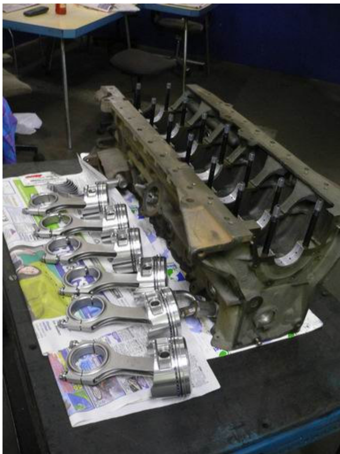
The new JE forged pistons on the rods and ready to go in the block