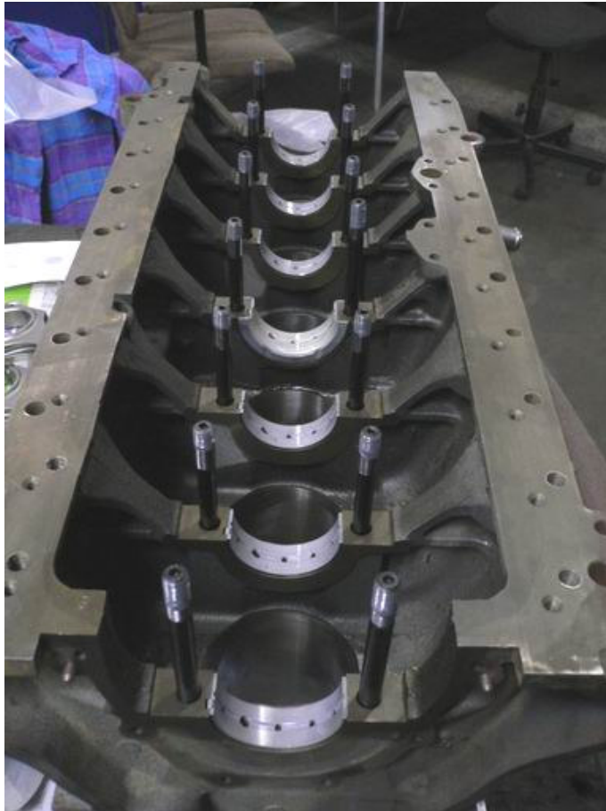
The block with bearings and ARP studs in place.